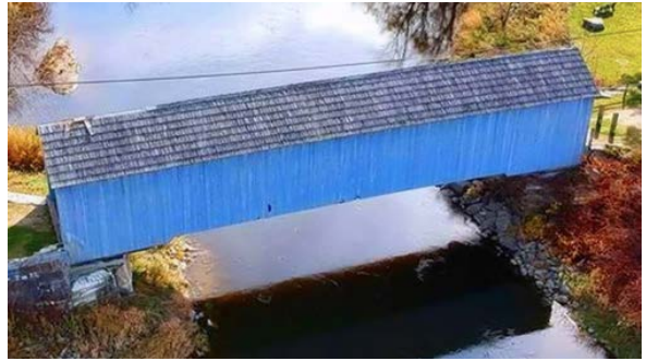
He claims the bridge sits over some of the most polluted water in America.