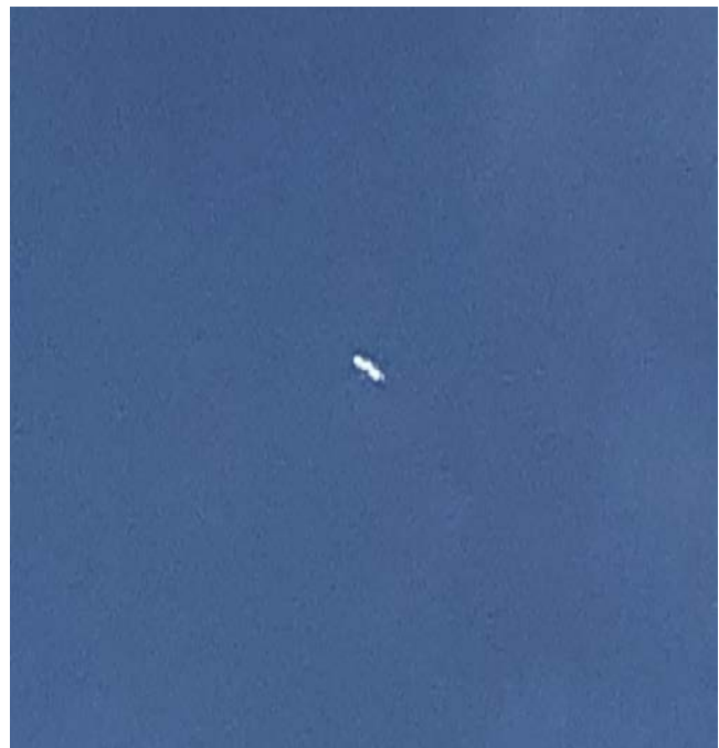
White Oblong Object July 26, late afternoon Warren area (Similar reports of this came from the Toledo area)