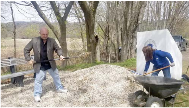
A monument was erected near the bridge to commemorate the sighting.