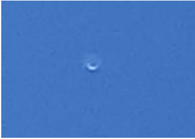
Translucent Object August 18, 10 a.m. Cleveland area (Similar Object reported in Cincinnati)