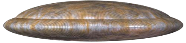
A detailed representation of the UFO the Reeds claim to have seen.

He explained to 9news.com.au everything was illuminated in glaring detail. A cacophony of noise erupted as crickets and frogs burst into frantic activity on the banks of the Housatonic River.