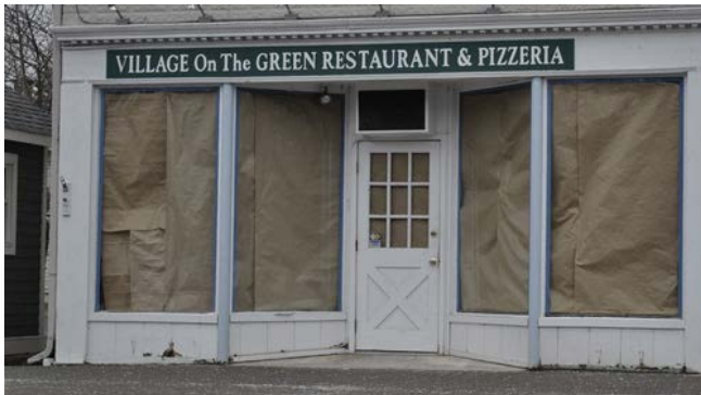
The family diner "The Village on the Green"

"What I saw changed my life. I used to be an altar boy... I don't have my faith anymore. It's gone. You start to think why are we here, and what all this means."